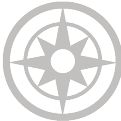
Mapping & Visualisation